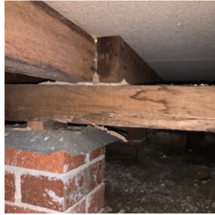
Past termite to subfloor timbers