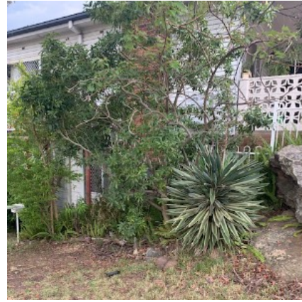
Vegetation to side