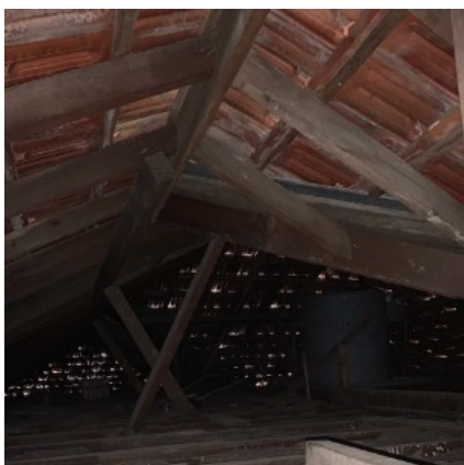
Roof void with insulation