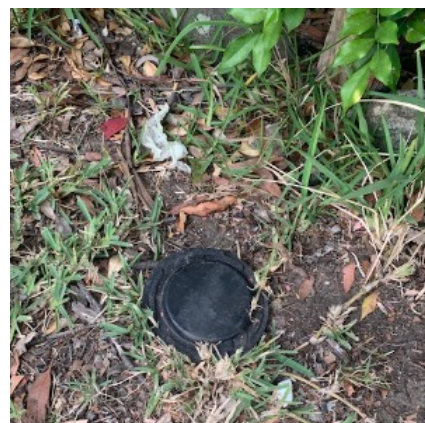
Termite bait station found in garden