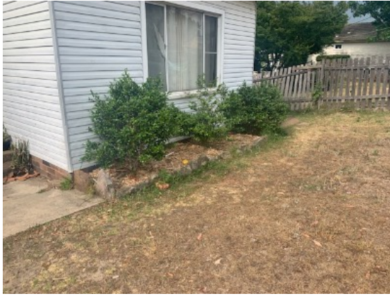
Vegetation to front