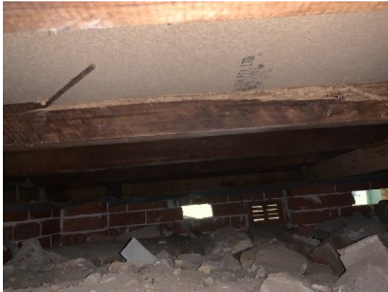
Past termite to subfloor timbers