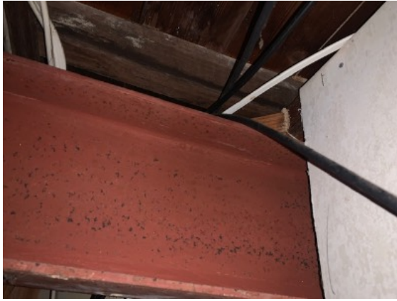
Past termite to subfloor timbers