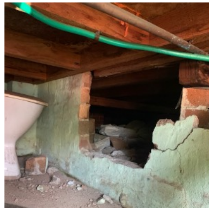
Brick piers with ant caps subfloor