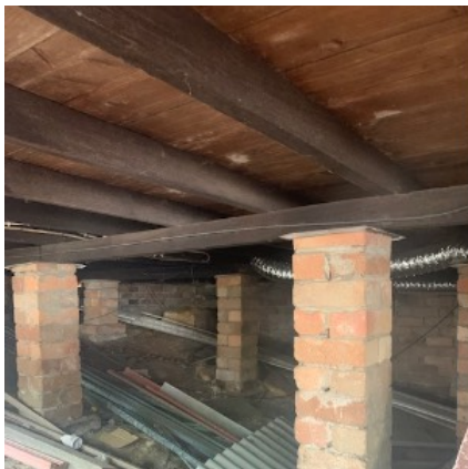
Brick piers with ant caps subfloor