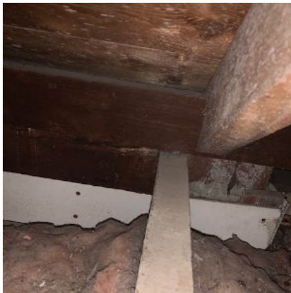
Past termite to roof timbers

Important - We claim no expertise in building and if any evidence or damage has been reported then you must have a building expert determine the full extent of damage and the estimated cost of repairs or timber replacement (See Section 3 Important Warnings & the Terms & Limitations).