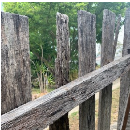
Past borer to fences