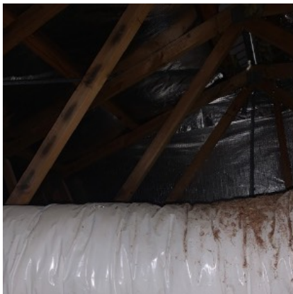
Roof void with insulation and air con ducting