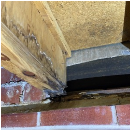
Wood rot found to garage roof timbers