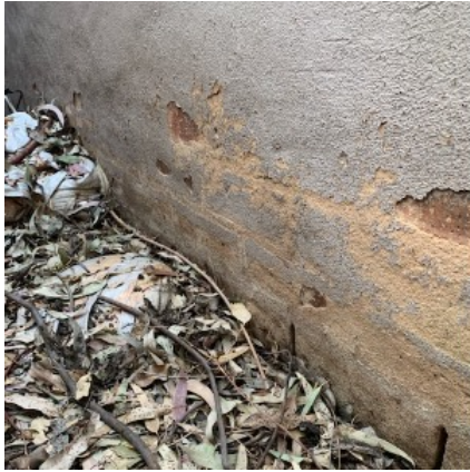
Weep holes covered at rear and side