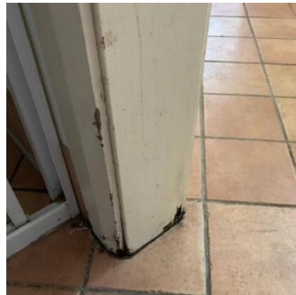
Wood rot found to bathroom door frame