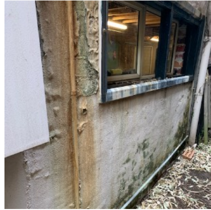
Mould found to side of house