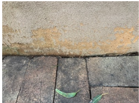
Concrete slab no access to subfloor