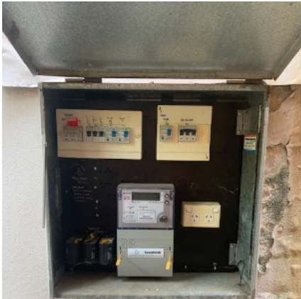
Photo Of Durable Notice